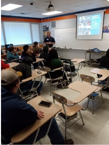
Nascar Institute- LHS Automotive